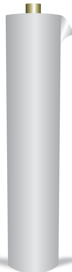
6' X 45' ROLL