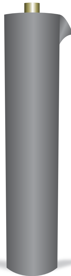
6' X 45' ROLL